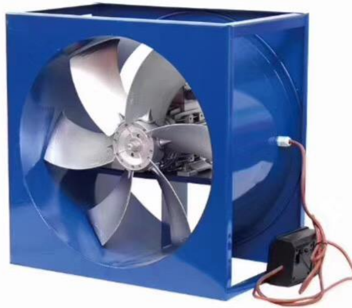
MTX-DF (Square Shape)