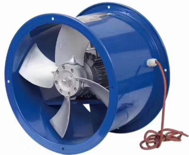
MTX-DF (Round Shape)